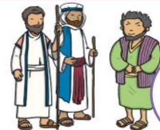
Judas, one of Jesus' disciples, agreed to betray him. The Chief Priests give him 30 silver coins.