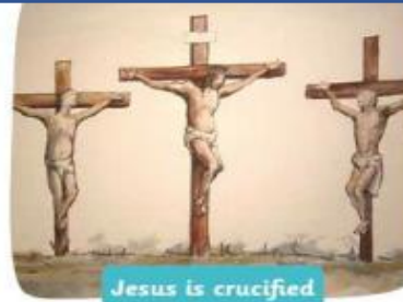
Jesus is crucified

Easter is a very special time for Christians when they remember the last week in the life of Jesus and their most important belief—that he came alive again after his death. This brought Christians forgiveness with God so they could feel together with God again